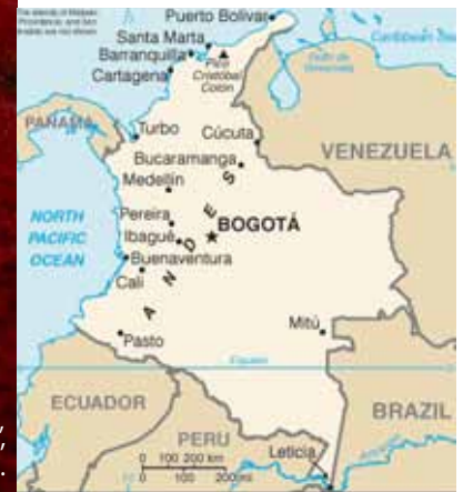
The Caño Cristales or "River of five colors", is considered the most beautiful river in the world.

Capital: Bogota, D.C. Location: Northwestern South America Extension: 440,831 sq mi Population: 47,072,915 Official Language: Spanish Currency: Colombian Peso Religion: Christianity Climate: Tropical along coast and eastern plains, cooler in highlands Administrative Divisions: 32 departments, one capital district, municipalities and corregimientos. Government: Unitary presidential constitutional republic