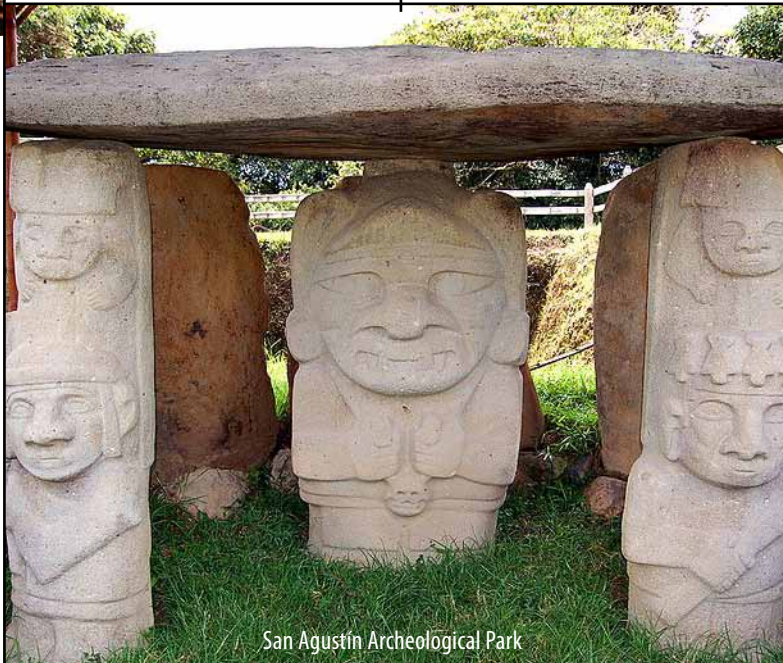
San Agustín Archeological Park