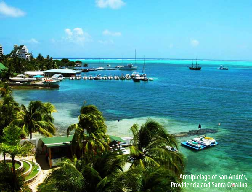
Archipiélago de San Andrés, Providencia and Santa Catalina

Geography. Colombia is characterized by six main natural regions: the Andes mountain range, the Pacific coastal, the Caribbean coastal, the Llanos (plains) and the Amazon Rainforest. Part of the Ring of Fire, this is a country subject to earthquakes and volcanic eruptions. There are three branches known as cordilleras (mountain ranges): Occidental, Central and Oriental. East of the Andes lies the savanna of the Llanos, part of the Orinoco River basin, and, in the far south east, the jungle of the Amazon rainforest. The main rivers of Colombia are Magdalena, Cauca, Guaviare, and Caquetá.