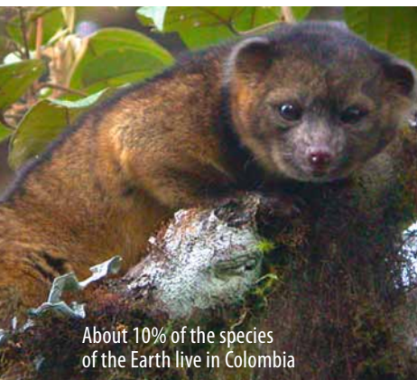
About 10% of the species of the Earth live in Colombia

In tierra fría (cold land), where wheat and potatoes dominate, temperatures range between 50 and 66 °F. Beyond tierra fría lie the alpine conditions of zona forestada (forested zone) and then the treeless grasslands of the páramos. Above 14,764 ft, where temperatures are below freezing, is the tierra helada, a zone of permanent snow and ice.