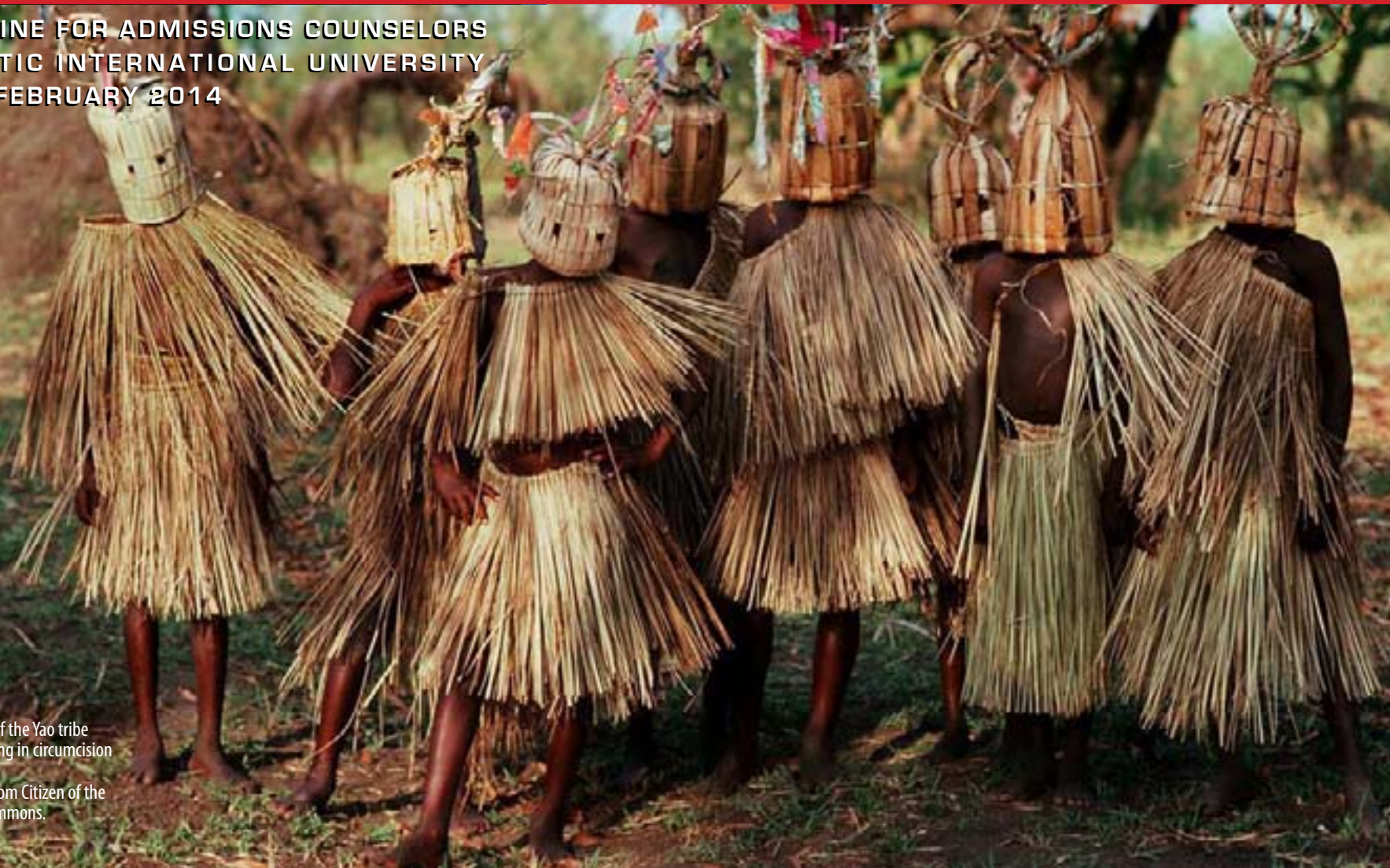
9–10-year-old boys of the Yao tribe in Malawi participating in circumcision and initiation rites.

MAGAZINE FOR ADMISSIONS COUNSELORS ATLANTIC INTERNATIONAL UNIVERSITY # 03 • FEBRUARY 2014