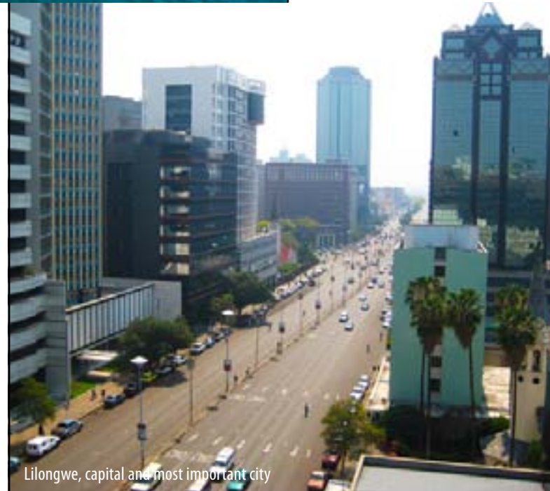
Lilongwe, capital and most important city

Brief History. The area of Africa now known as Malawi was settled by migrating Bantu groups around the 10th century. Centuries later, in 1891 the area was colonized by the British. In 1953 Malawi, then known as Nyasaland, became part of the semi-independent central African Federation (CAF). The Federation was dissolved in 1963 and in 1964, Nyasaland gained full independence and was renamed Malawi. Upon gaining independence it became a single-party state under the presidency of Hastings Banda, who remained president until 1994, when he was ousted from power.